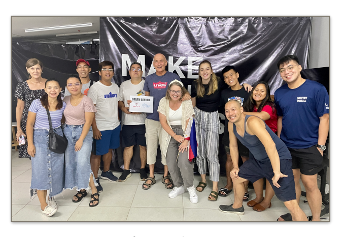
First group for Manila Dream Center

We are so honored to be His ambassadors in Manila. Living the dream we prayed into for years. Speaking of which- DREAM center launched on June 6th with 12-16 missionaries (mostly Filipino)! Mentorship and workshops are in full swing now- thank you for praying with us and making so much in the Kingdom possible!!!